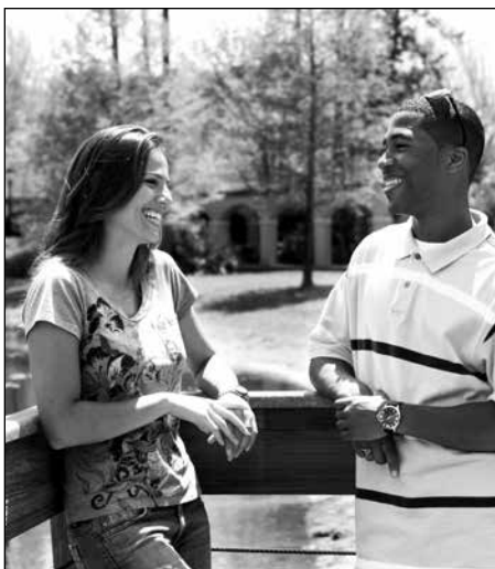
ST. AUGUSTINE CAMPUS