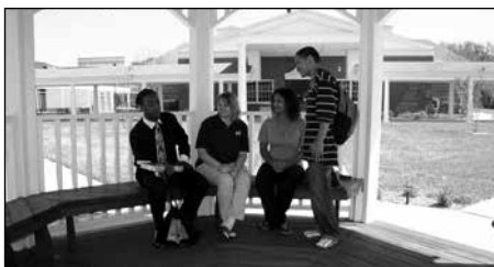
ORANGE PARK CAMPUS