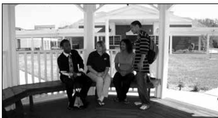
ORANGE PARK CAMPUS